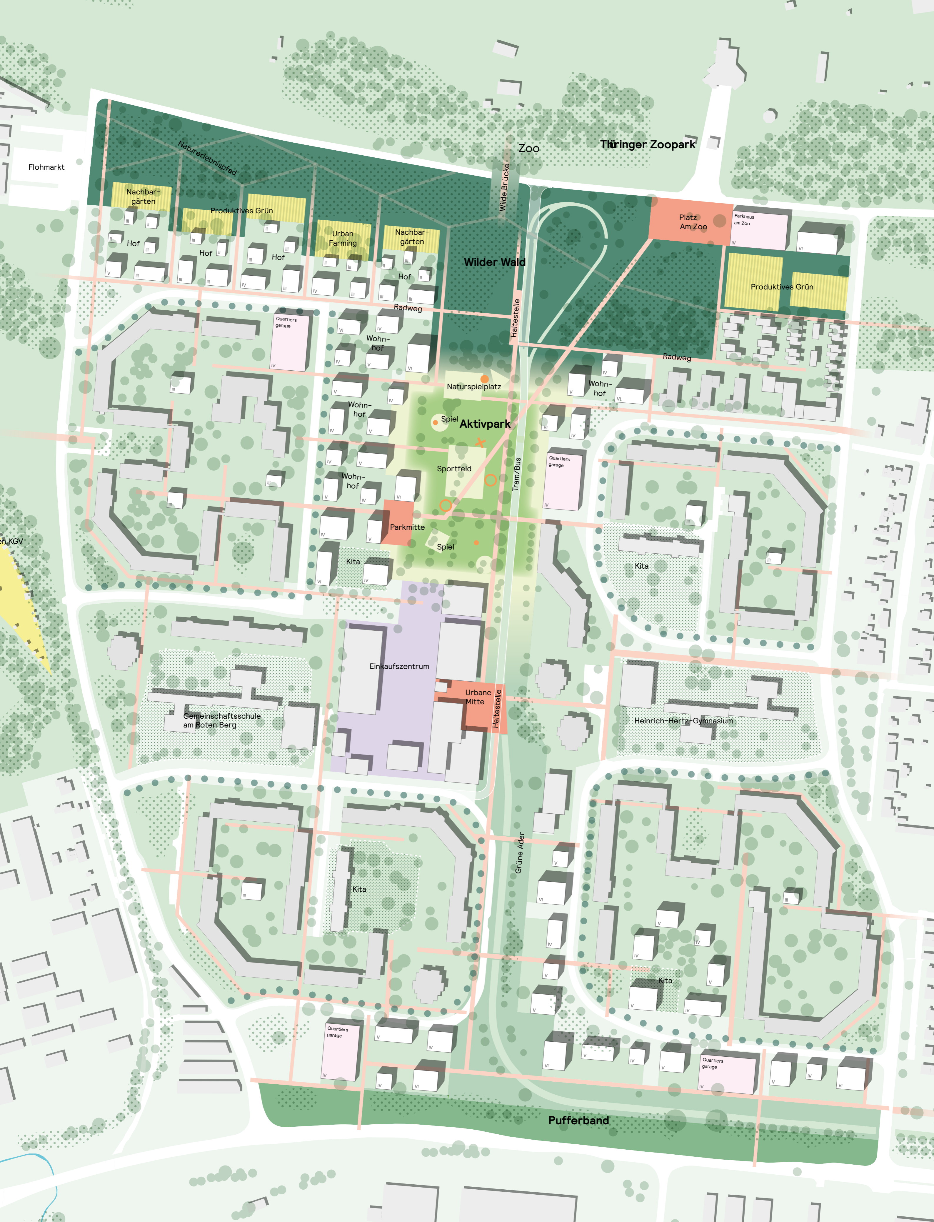
V2: 'Strukturwandel' // Lageplan M 1:2000