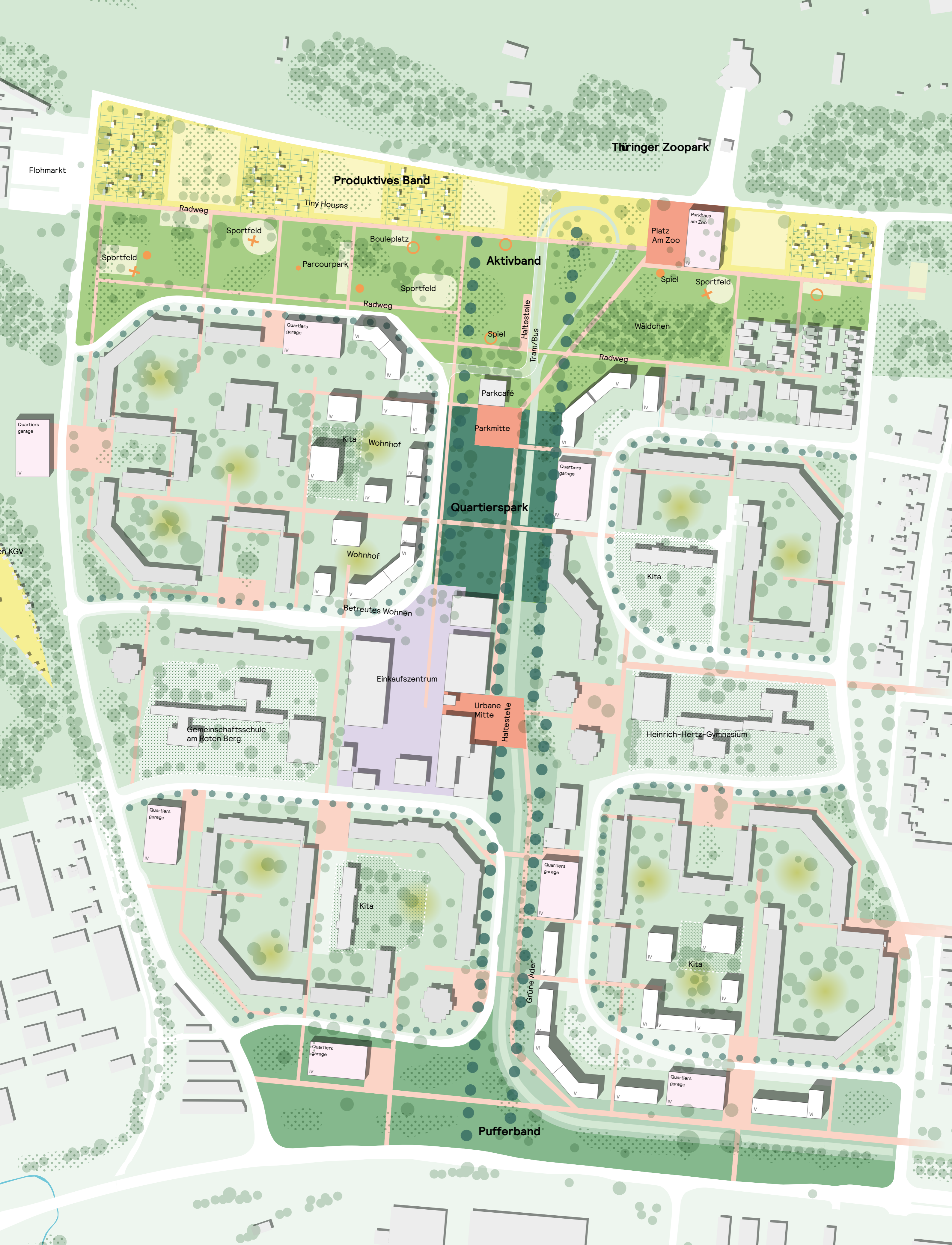
V1: 'Roter Berg 3.0' // Lageplan M 1:2000